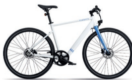
TENWAYS CGO600 £1,499

A bit sportier geometry than the Raleigh with a more powerful Bosch mid-drive, though the same size battery. You can pay extra for 500Wh or 625Wh versions. cube.eu