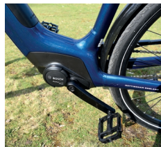
Bottom: Maximum torque is 'only' 50Nm but the Bosch Active Line Plus mid-motor benefits from the bike's wide-ratio 8-speed hub gear so the Raleigh climbs well enough

slightly neater on the Raleigh where it enters via the oversize head tube and exits via the chainstays. On the Volt, cables enter the underside of the down tube near the head tube and exit near the bottom bracket, leaving cable runs a little more exposed at the rear of the bike. The Volt comes equipped with a porteur-style front rack and has fittings for a rear rack. The Raleigh has a rear rack but won't take most front ones.