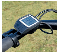
Top: Bosch's Purion display is compact and easy to use

Brake, gear and electrical cabling is internally routed in both cases, though