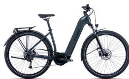
CUBE TOURING HYBRID ONE 400 £2,399

A bit sportier geometry than the Raleigh with a more powerful Bosch mid-drive, though the same size battery. You can pay extra for 500Wh or 625Wh versions. cube.eu