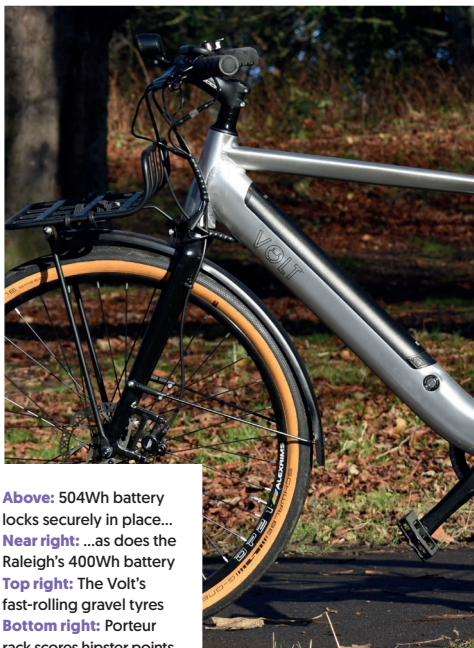
Above: 504Wh battery locks securely in place... Near right: ...as does the Raleigh's 400Wh battery Top right: The Volt's fast-rolling gravel tyres Bottom right: Porteur rack scores hipster points

At Cycle, we are proudly independent. There's no pressure to please advertisers as we're funded by your membership. Our product reviews aren't press releases; they're written by experienced cyclists after thorough testing.